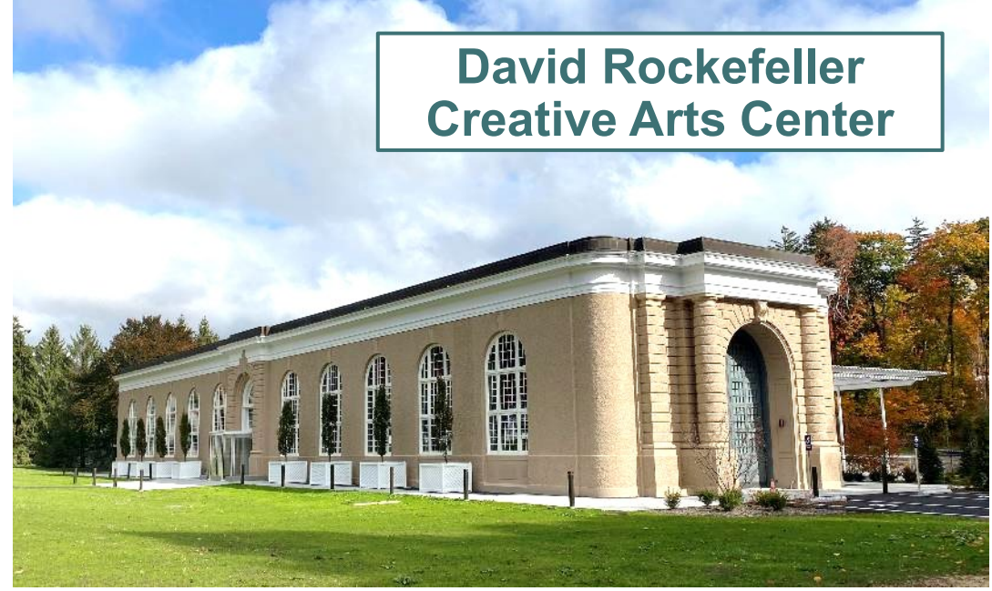
David Rockefeller Creative Arts Center